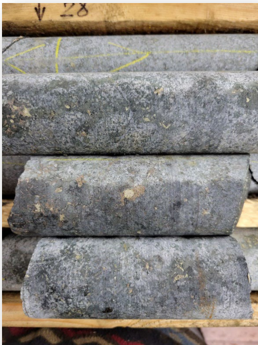
Figure 2 Hole LL-08 at 28 metres showing classic magmatic silicate-sulphide textures.